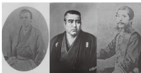
Katsura Kogoro (Kido Takayoshi), Saigo Takamori, and Okubo Toshimichi

Featuring materials circa 1864, this exhibit shows how Kaishu actively sought to connect with people across the boundaries of the Edo shogunate and the various domains.